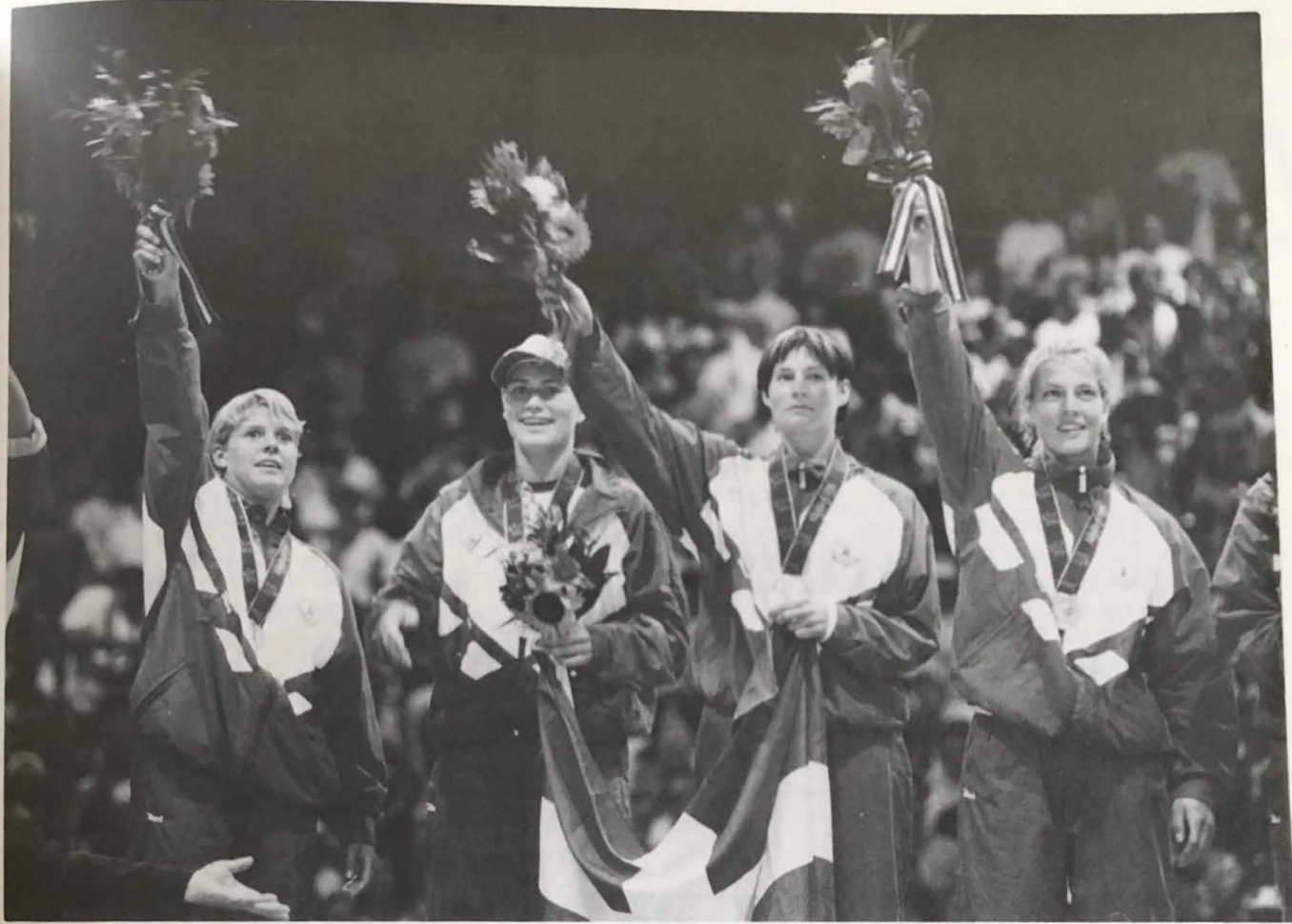
The popular Danish handball team after receiving their Gold medals